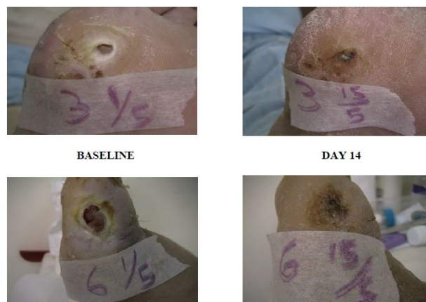
Figure 2: Visual evidence of healing both in terms of granulation tissue and degree of closure.

After cessation of treatment at 3 weeks, the patients were followed for an additional period that ranged up till 12 weeks. Using closure as an endpoint, 9 out of 15 (60%) responded to IZN 6D4 (Figure 2).